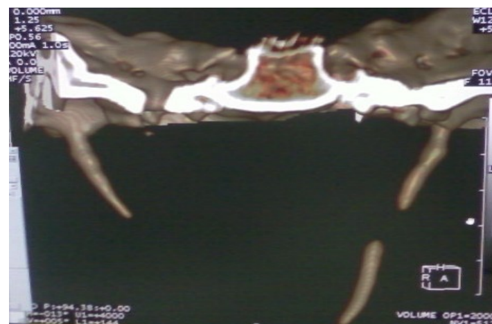
Figure 2 : 3D reconstruction of the coronal volume: discontinuous left styloid apophysis and abnormally elongated (white arrow)