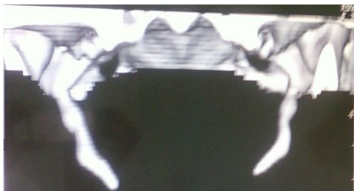
Figure 4 : 3D reconstruction of the coronal volume: stocky hooked styloid apophysis(white arrow).